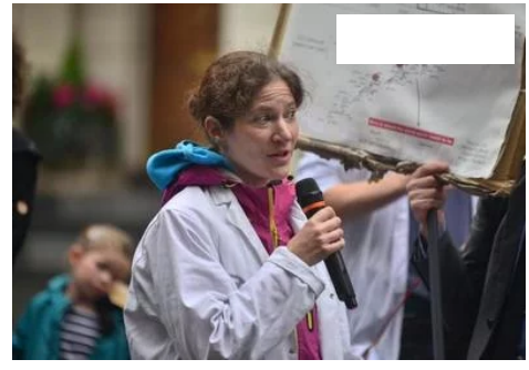
Scientists endorse mass civil disobedience to force climate action 13 Oct