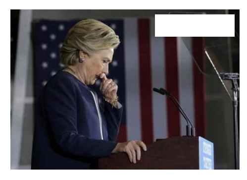
Clinton's charity confirms Qatar's $1 million gift while she was at... O5 Nov